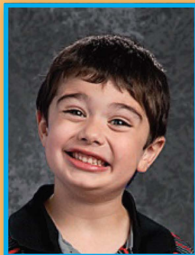
Dyson Day Kindergarten B